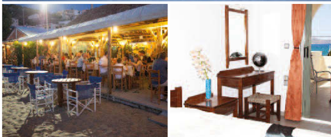
Mistrali beach restaurant