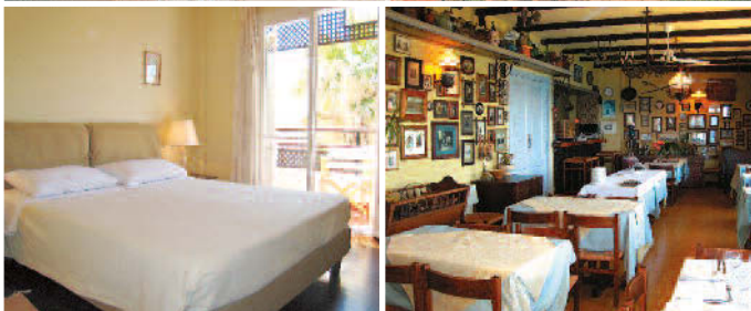
Doma Hotel breakfast room