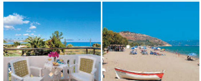
Beach close to Afrodite Apartments