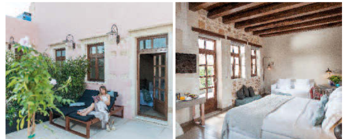
Doma Hotel (right hand side)