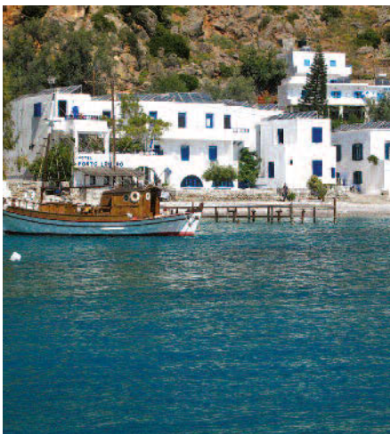
Porto Loutro I

baggage the short distance to the jetty, on/off the boat and to the hotel (1 minute). Loutro combines very well with Paleochora - please see twin-centre holidays note on resort intro. page.